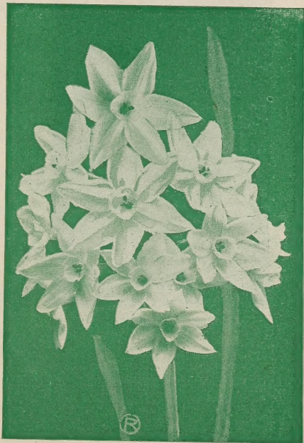
Narcissus (Paper White Grandiflora).